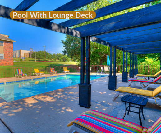
Pool With Lounge Deck